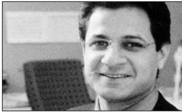
People at KSB – We make your world flow round!

KSB can look back on more than 130 years' tradition in production of pumps, valves and related systems. As a result, our pumps benefit from the wealth of know-how KSB engineers have gathered in research, development and production.