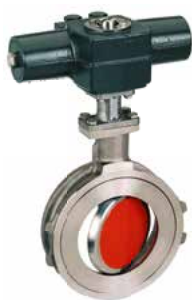
DANAİS 300T with ACTO 25