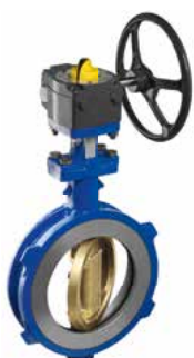
DANAİS 150C + Mr